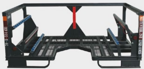
Rack for the side part