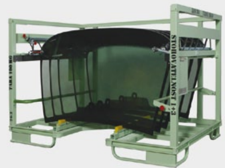
Rack for windscreens