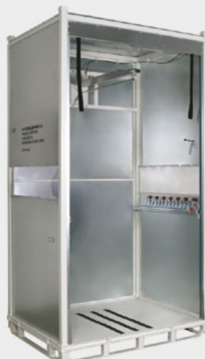
Rack for overhead panels