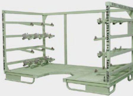
Rack for stringers