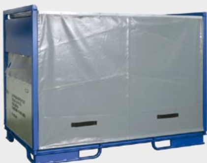
Rack for overhead panels